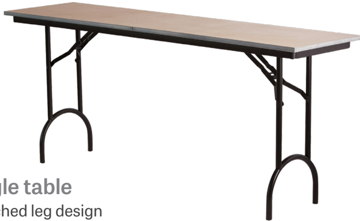
rectangle table classic arched leg design

These lightweight and sturdy tables are easy to set up and take down. Coming in a variety of sizes and shapes to meet any need and space, the steel frame and plywood surface will last for years. The spring-loaded leg brace locking mechanism with the non-slip leg glides means the table stays in place.