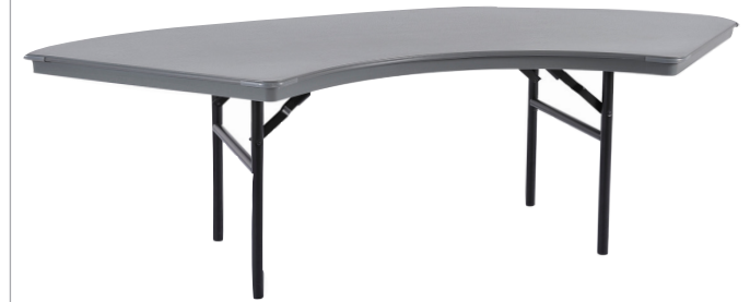
quarter round, half round and crescent table square leg design