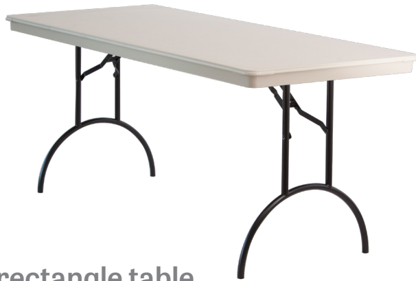
rectangle table classic arched leg design

These lightweight and sturdy tables are easy to set up and take down. Coming in a variety of sizes and shapes to meet any need and space, the steel frame and impact resistant surface will last for years. The spring-loaded leg brace locking mechanism with the non-slip leg glides means the table stays in place.