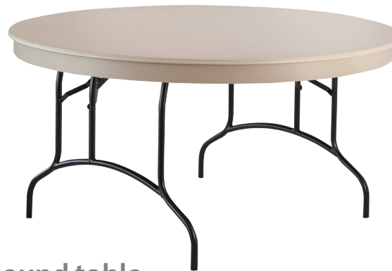
round table classic arched leg design